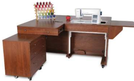
Kangaroo & Joey Sewing Cabinet

Sewing cabinets provide comfort, easy set-up and dedicated storage for your machine and notions. They produce an enjoyable, ergonomic sewing experience and create a spirited environment for sewing and crafting! Your machine deserves better than the dining room table, and so do you! Sew in comfort and sew longer with Kangaroo's sewing cabinets!