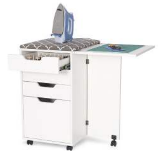
Kiwi Storage Cabinet

Every dream sewing oasis needs its cute, dependable accessories! Add even more convenience with a storage cabinet like Kiwi , featuring a built-in ironing board, cutting mat, thread drawers and a dedicated drawer to store your iron! Your dream sewing space won't be the same without it!