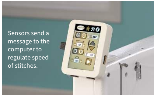
Sensors send a message to the computer to regulate speed of stitches.